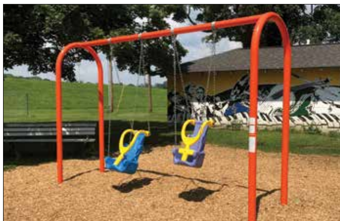
Dansbury Park, East Stroudsburg – see 1 on map, page 10