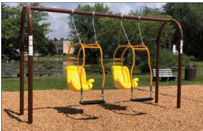
Jay Alberton Park, Stroud Township – see 11 on map, page 10