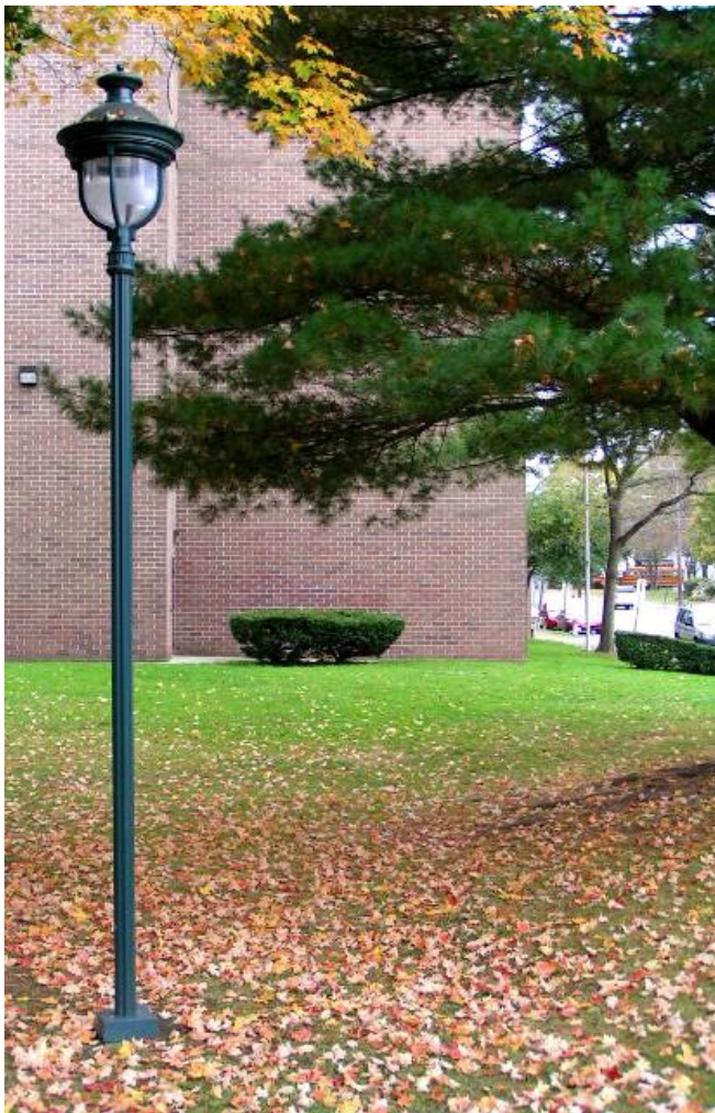
Westgate Park, Stroudsburg

The Commission Board consists of eight members; two from each of the municipalities and one from each school district; it employs an Executive Director, Program Coordinator, and various seasonal programming staff; and coordinates many important contributions to the parks through its Volunteers in Parks program.