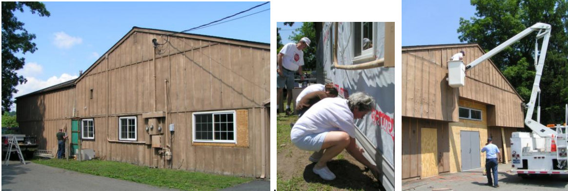
“The Great Vinyl Siding Cover-up” before, during, and after...

After serving many years as a police station, the building is undergoing renovations to meet current codes and transform its use into a public community resource. Both exterior and interior renovations during the year have made great progress towards those ends.