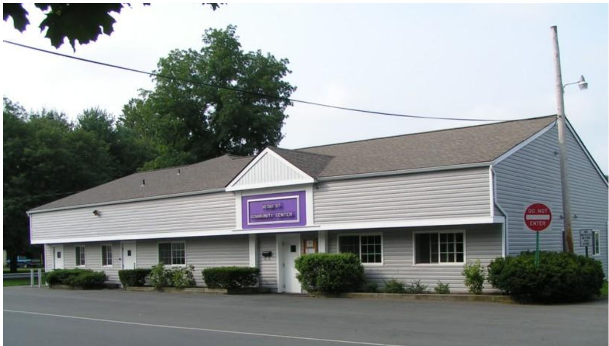
Day Street Community Center, August 2007