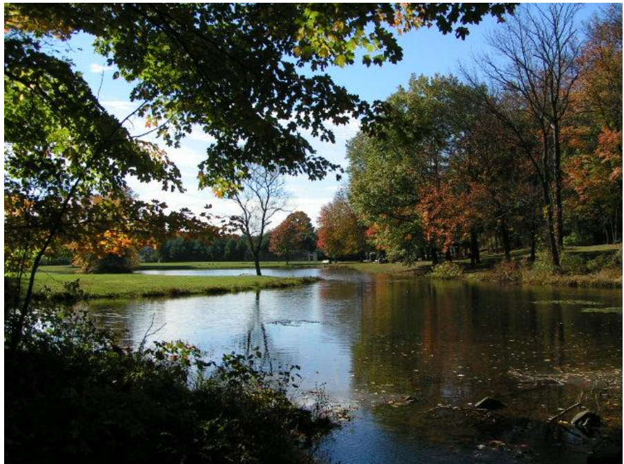
Zacharias Pond Park, East Stroudsburg

The Commission's full time staff members are professional members of the National Recreation and Park Association and the Pennsylvania Recreation and Parks Society.