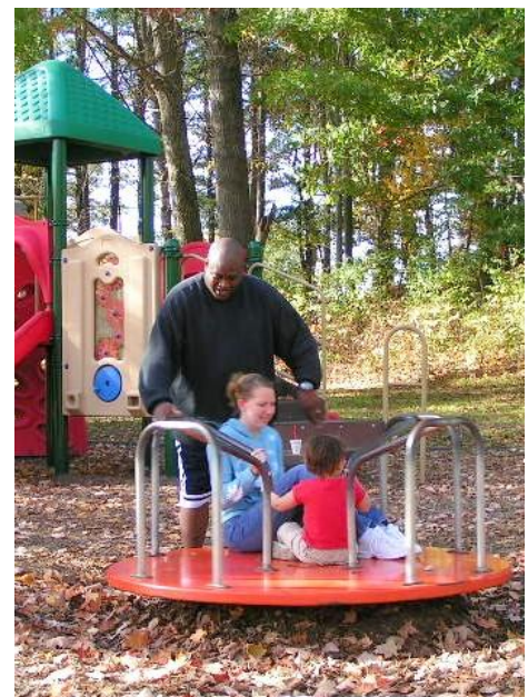
Zacharias Pond Park

Recognizing the limitations of our small staff and volunteer Commissioners, an informal Creative Consultants Team was envisioned for the coming year as a corps of creative individuals willing to share ideas, expertise, and professional and social networks in helping to deliver high quality, innovative, and desired recreational, educational, environmental and cultural programming to all who live, work, and play in the Stroud Region.