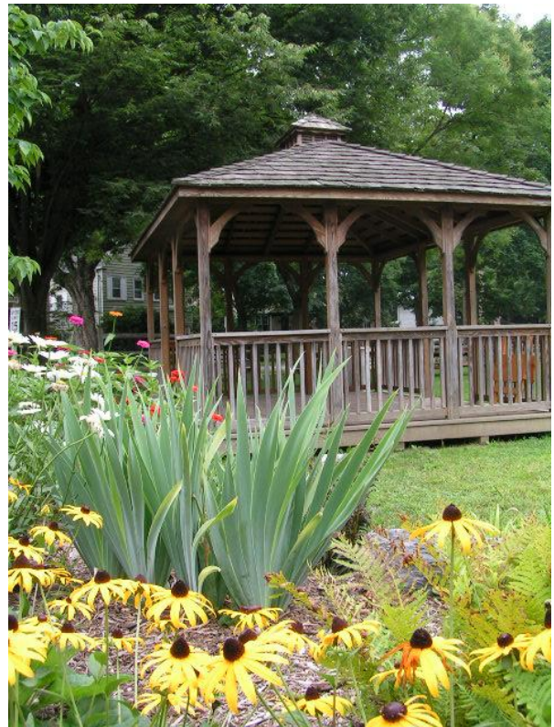
Bryant Street Park, Stroudsburg

A comprehensive Commissioner and Employee Policy Manual, based on established but disconnected Commission policies, and those adapted from the Stroudsburg Borough Policy Manual was developed and adopted in October. The Manual includes Introduction, Commissioner Responsibilities, Employment Responsibilities, Employee Benefits, and Appendices of the Intergovernmental Agreement and By-laws.