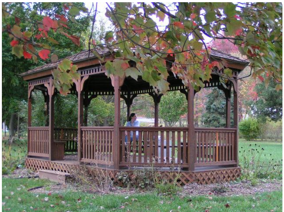
Jay Albertson Park, Stroud Township