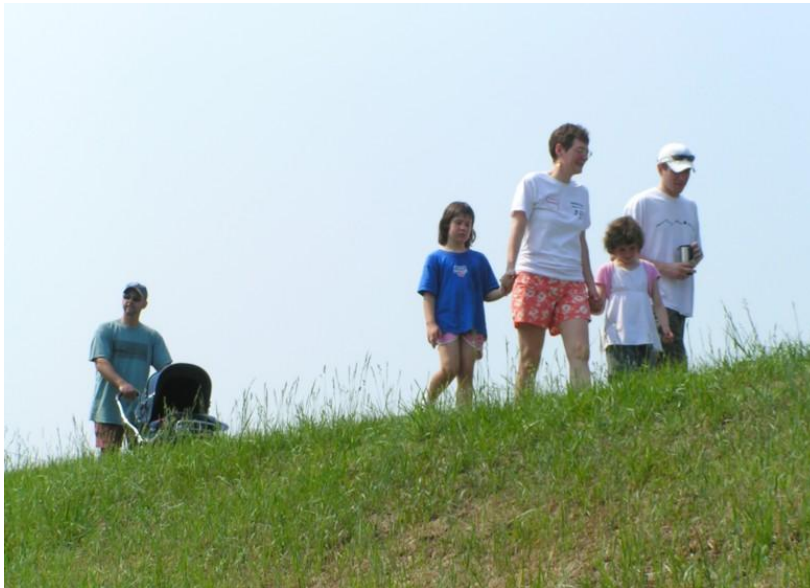
Fitness Walk on the levee, Dansbury Park